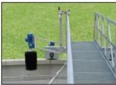
KD 16.11 Channel brush.