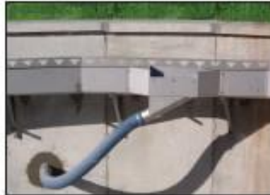
KD 16.08 Scum outlet, fitted directly to KD 16.18 stainless steel channel, where the side facing the centre part acts as scum board. Can also be fitted to KD 16.17 scum board.