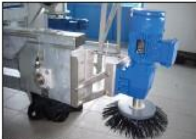
KD 16.19 Runway brush.