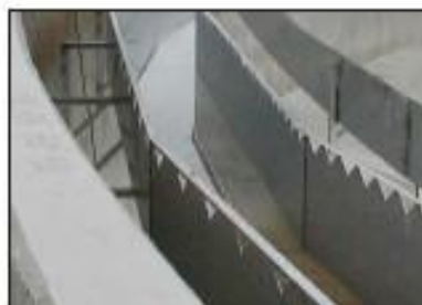
KD 16.18 stainless steel channel with V-notch weir on both sides, as well as KD 16.17 scum board.