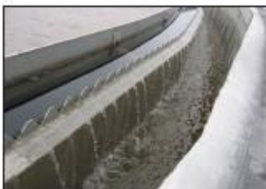
Concrete channel with: KD 16.17 Scum board KD 16.14 V-notch weir