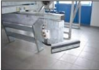
KD 16.10 Snow scraper.