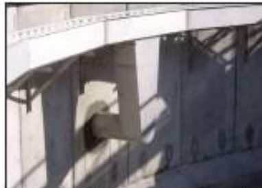
KD 16.18 stainless steel channel with outlet.