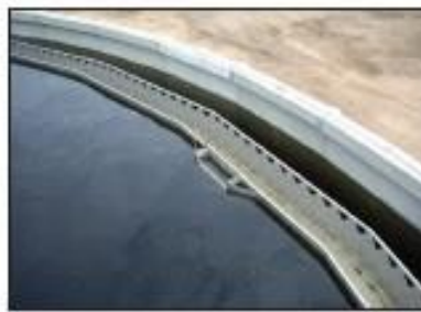
KD 16.08 Scum outlet, fitted directly to KD 16.18 stainless steel channel, where the side facing the centre part acts as scum board. Can also be fitted to KD 16.17 scum board.